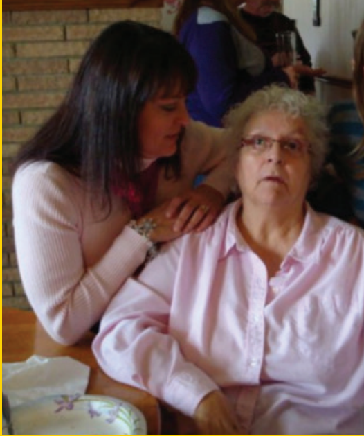
At the nursing home in 2010