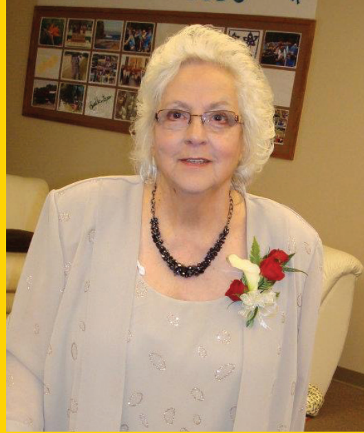
At Hope & A Future in 2016