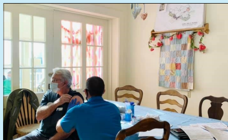
Thankful for Covid vaccines

It is hard to describe the weight that left our shoulders when immunizations came and made it possible for us to allow outdoor contact for family and resi-