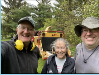
Spring work day

Thank you to all our donors and volunteers. Through birthday fundraisers on Facebook, caring for our property, the Mallards 50/50 raffle, and much more your support been the foundation of our continued success at Hope & A Future!