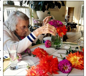
Making beautiful things