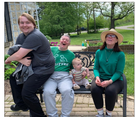
Our family of friends

speak at the Environments for Aging Conference in TN with a group from Erdman Architects. After 20 years of work, the TIIN model continues to be a new and desirable idea. Our development team and capital campaign committee are hard at work with planning. Please follow us on Facebook and sign up for our monthly newsletter to follow our progress and see how you can get involved.