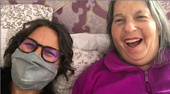
Connections during Covid

During the winter we built a visiting bubble-made of construction plastic and cleaned with UV light. After immunizations we were able to take it down when both outdoor visits and limited indoor visiting became possible.