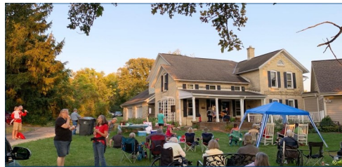
Our Current Adult Family Home

We are grateful for our beautiful award-winning Adult Family Home (AFH) and everyone who has helped us to provide intergenerational experiences and care, enabling our residents and staff to live with purpose. We are thrilled to share that we are ready to take the development of our TIIN model to the next level.