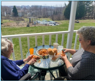
Doing meaningful work together

Mission: Creating an inclusive and vibrant neighborhood where older adults and families with young children help each other flourish.