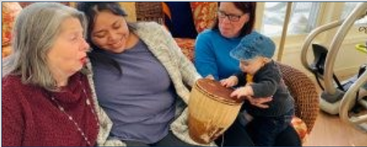
Making beautiful music

3440 S. High Point Rd. Madison, WI 53719 Phone: 608-831-0243 Email: TIIN@hopeandafutureinc.org