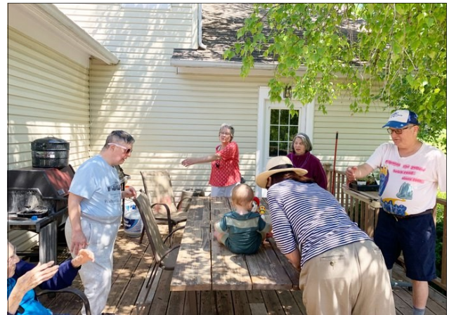
Fun in the shade