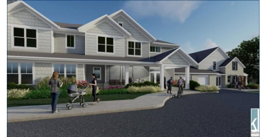
A Rendering of our completed vision

Our current Adult Family Home serves four residents of advanced age or developmental disability. We also have had staff and their children who live on site, receiving room and board in exchange for helping with evening and weekend hours. Ten to 12 people live